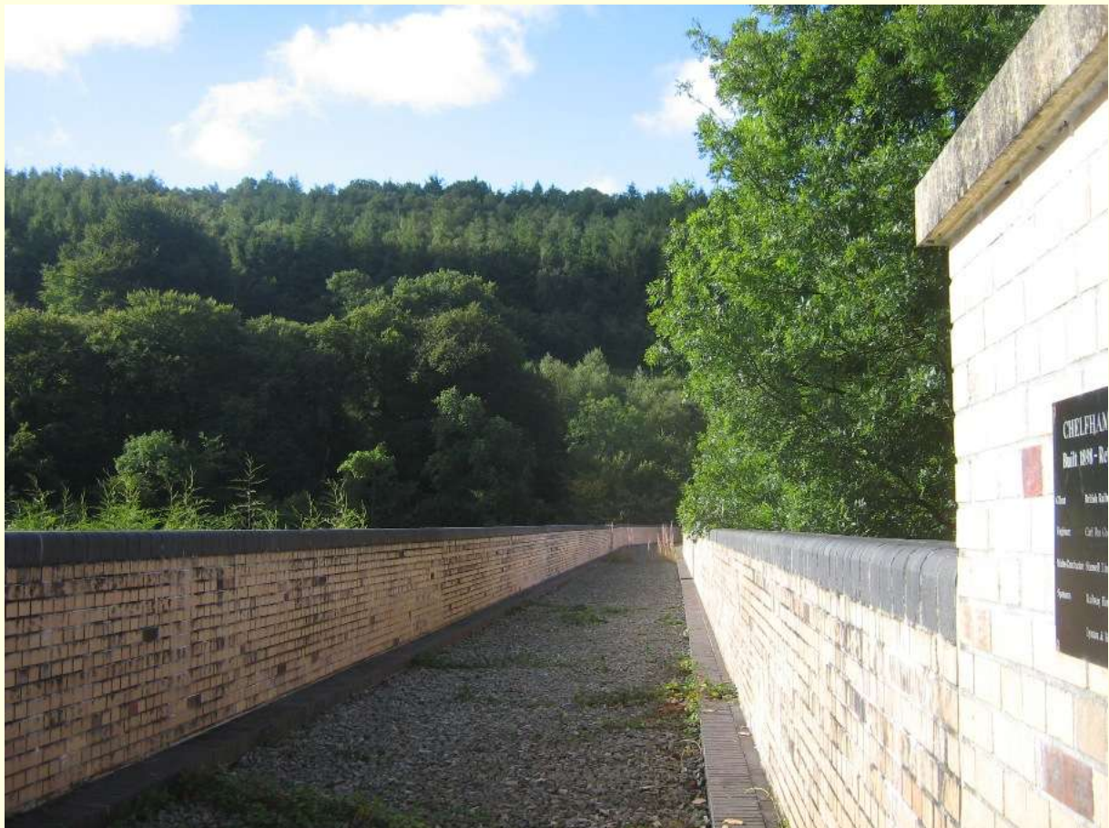
Chelfham Viaduct, Barnstaple to Lynmouth Railway