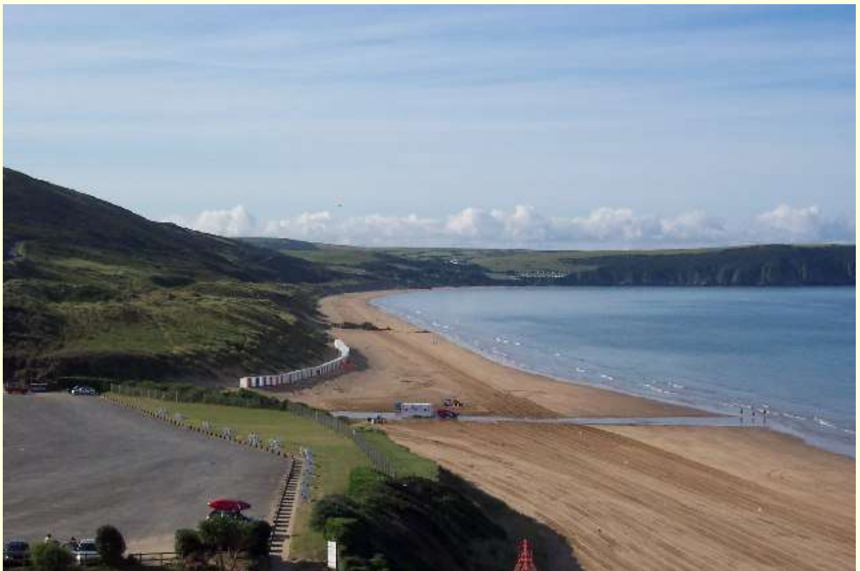
Woolacombe Sand http://www.geograph.org.uk/photo/42691