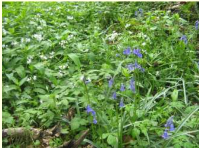
Bluebells and wild garlic