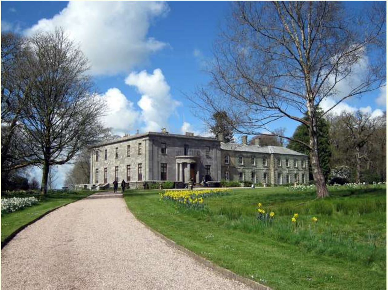
Arlington Court http://www.geograph.org.uk/photo/2905115