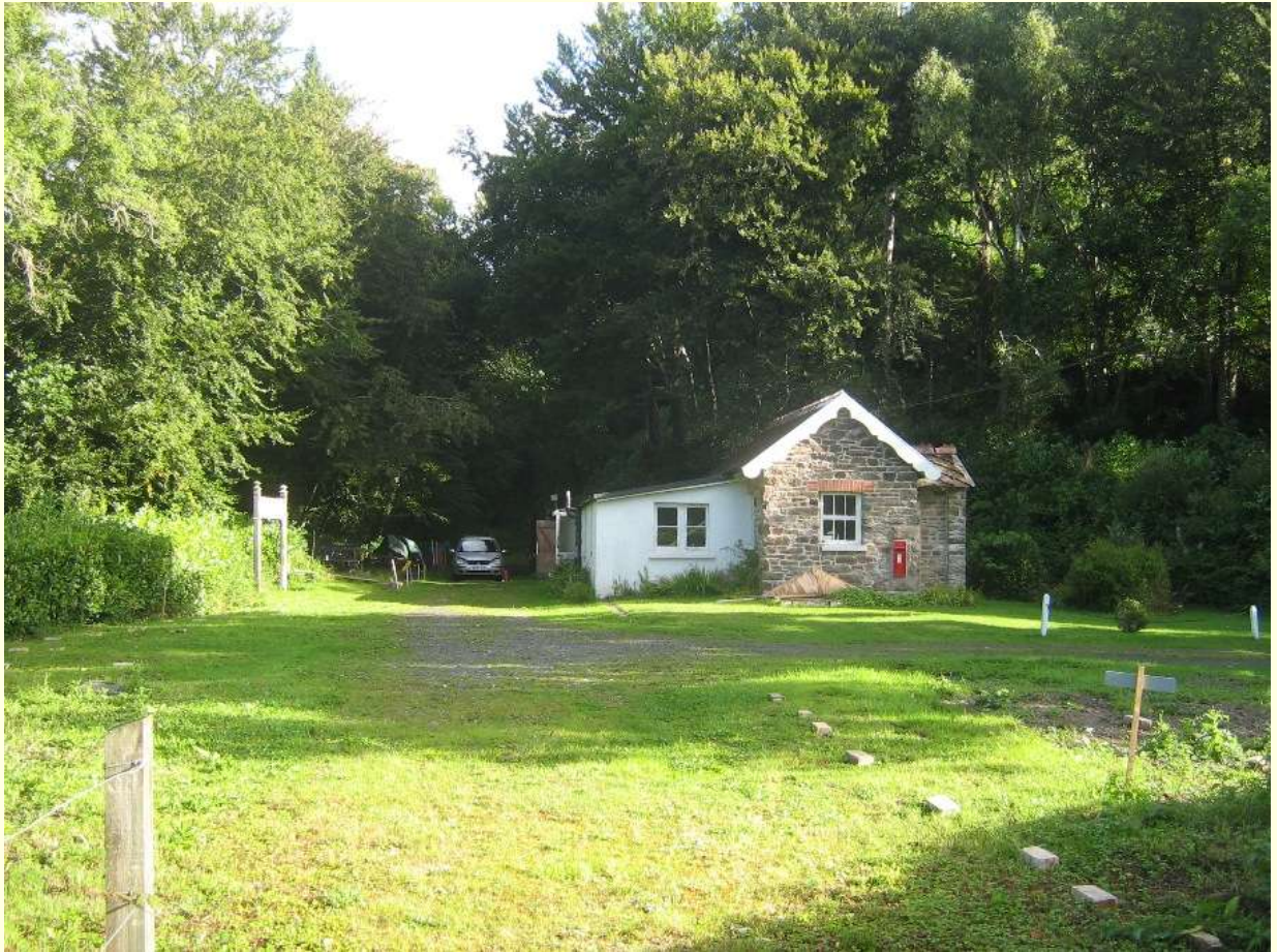
Chelfham Railway Station