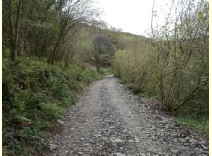
Shoot Lane: main access