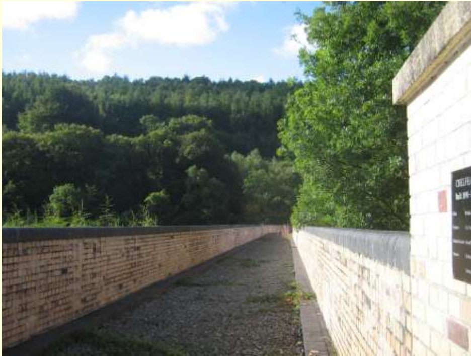
Chelfham Viaduct, Barnstaple to Lynmouth Railway