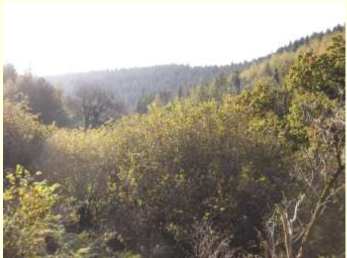
View up valley