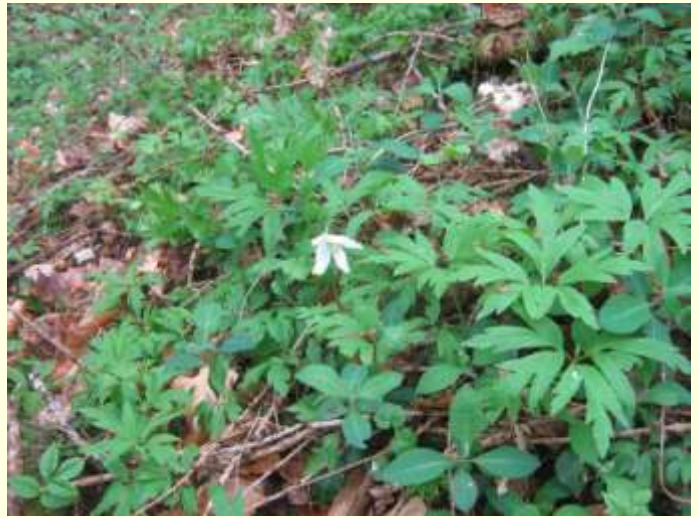
Ancient woodland groundflora: wood anemone