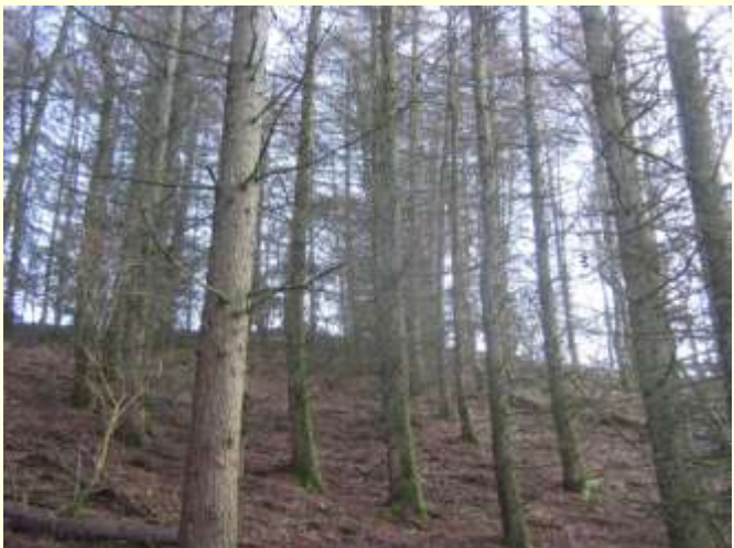
Larch planned for harvesting 2015