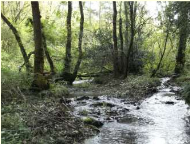
Stream running along woodland