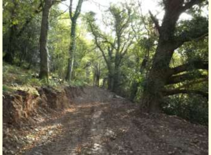
Track through wood