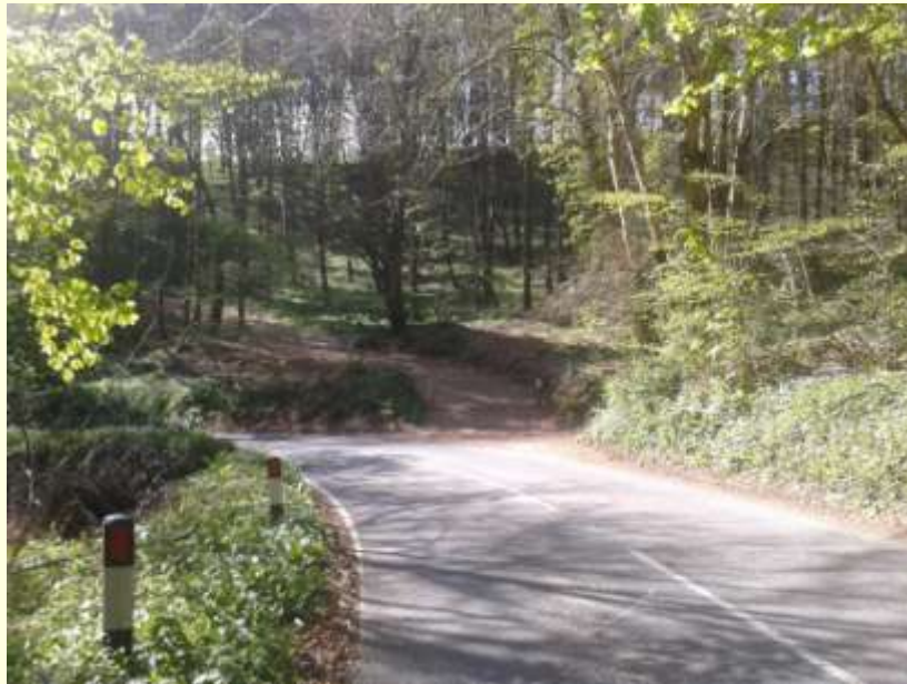
Timber extraction route