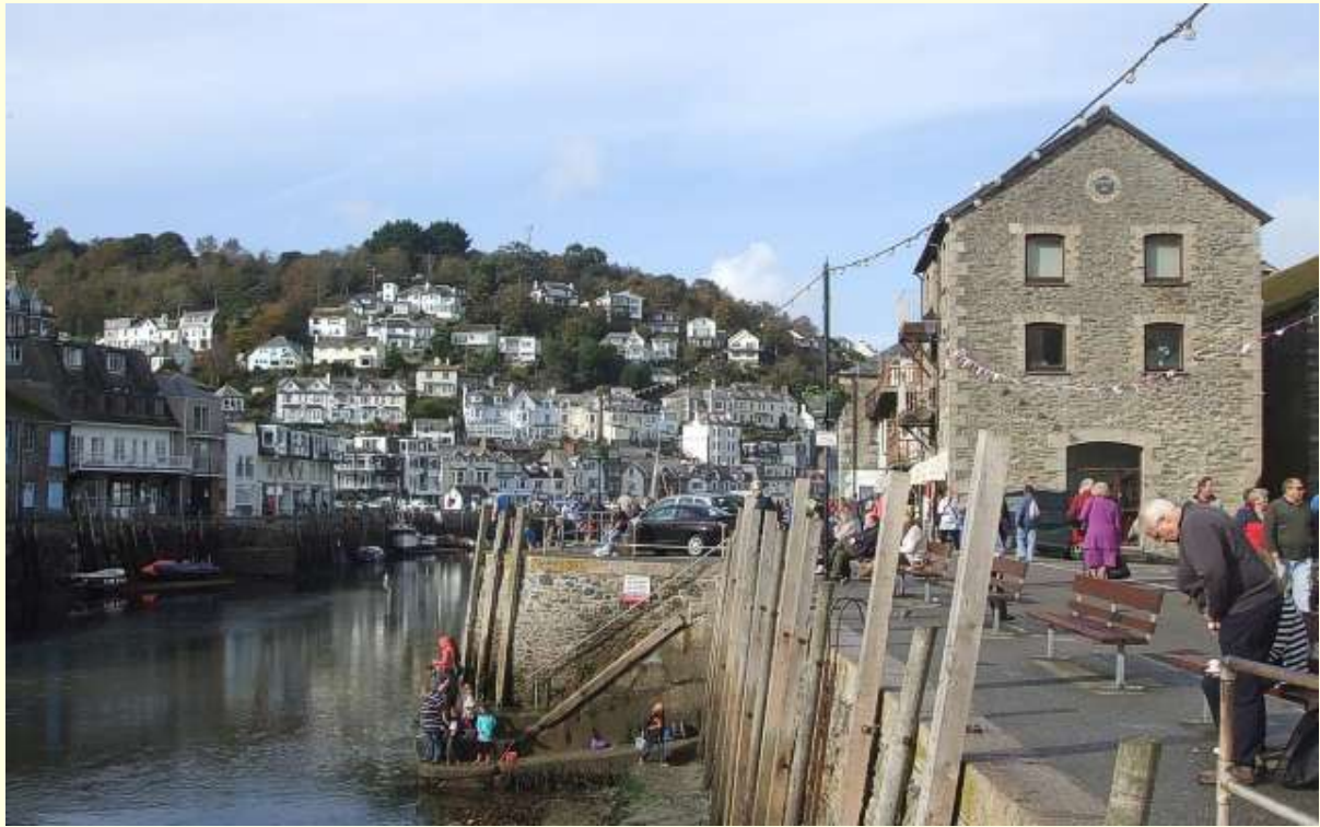
Looe harbour