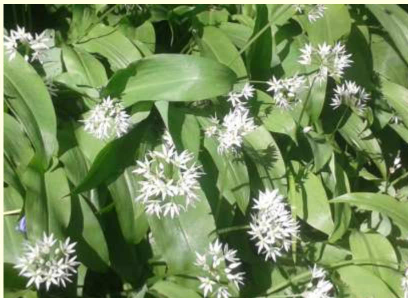
Ramsons or Wild Garlic