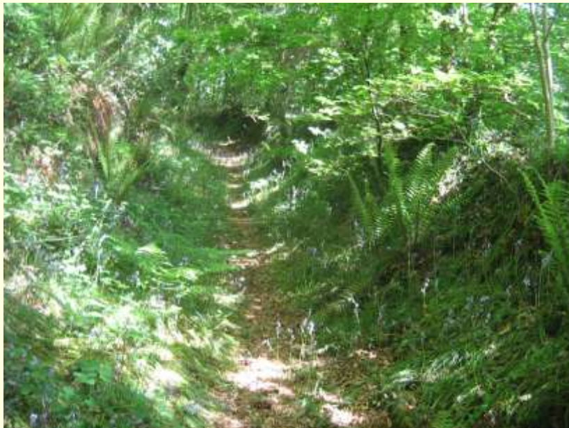
Old green lane