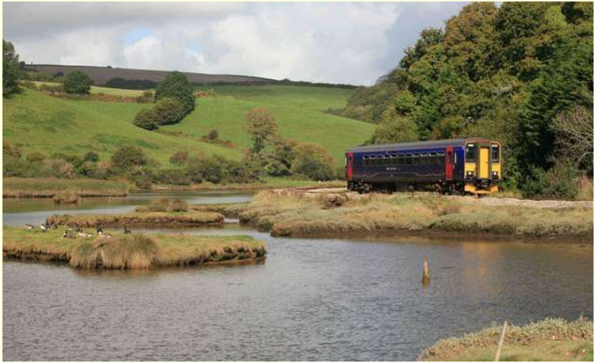
Looe Valley line near Sandplace