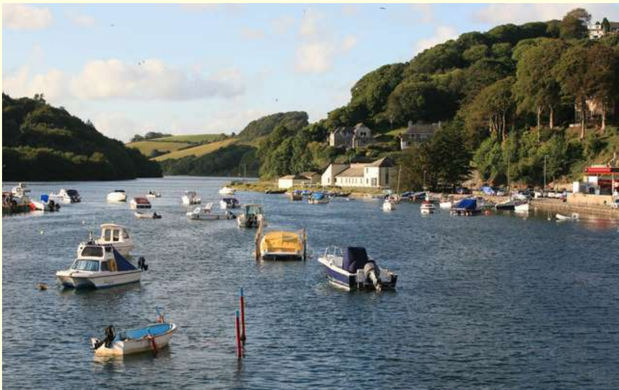
Looe Valley http://www.geograph.org.uk/photo/2555292