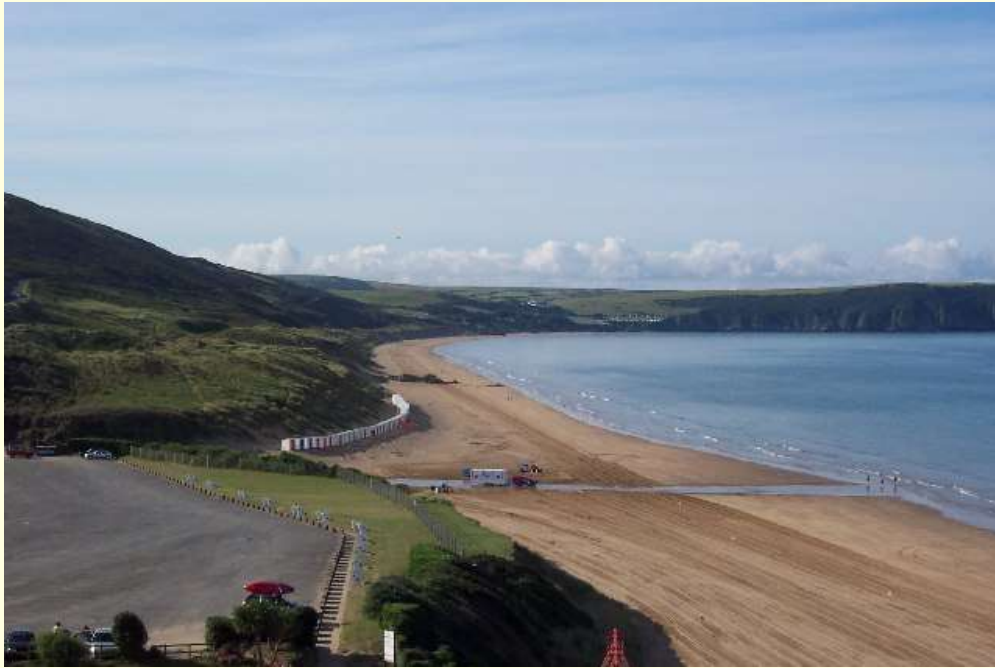
Woolacombe Sand