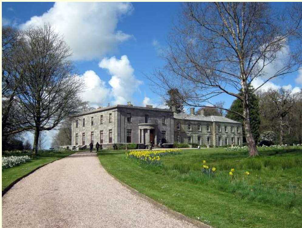
Arlington Court http://www.geograph.org.uk/photo/2905115