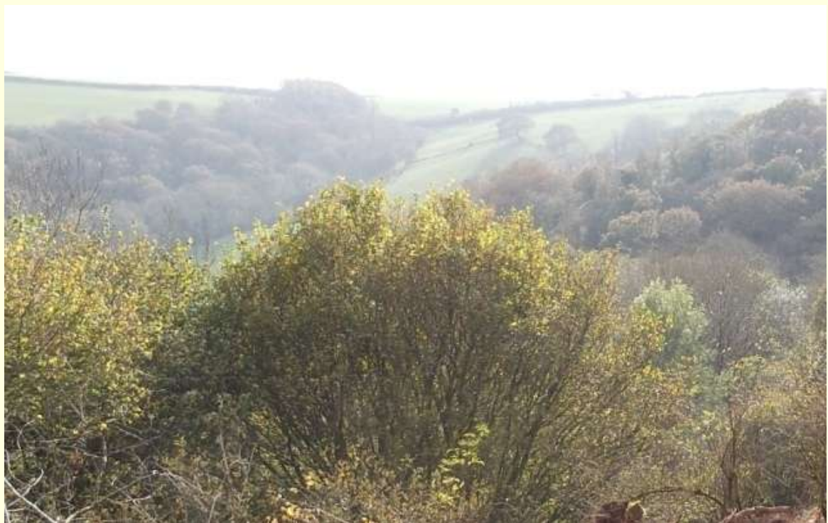
View from top track