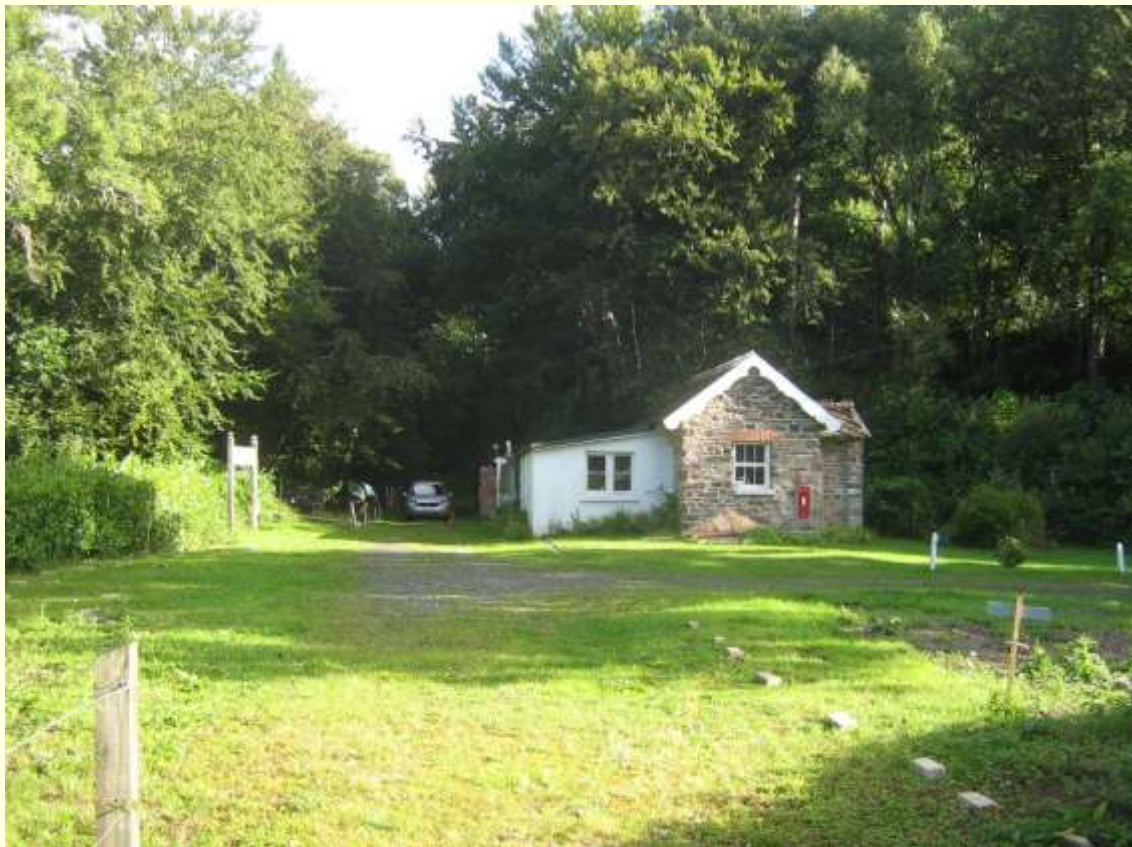
Chelfham Railway Station