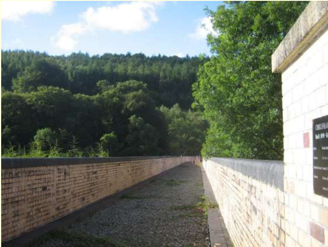
Chelfham Viaduct, Barnstable to Lynnmouth Railway