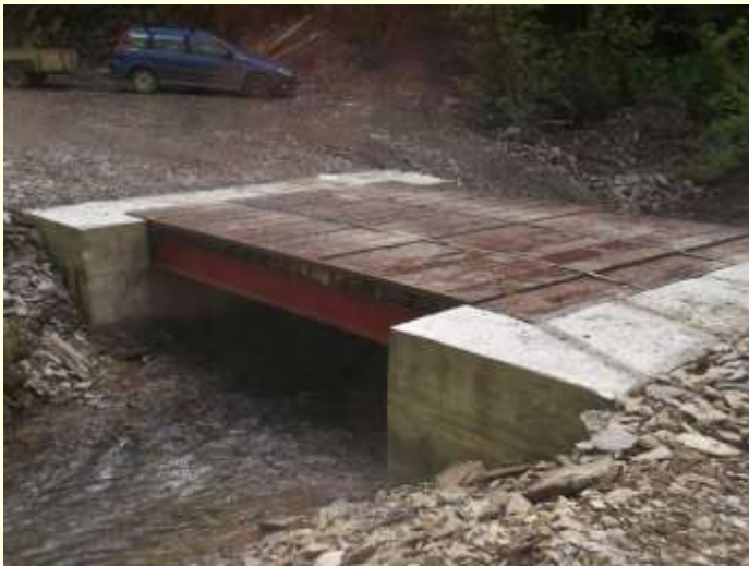
New bridge for access